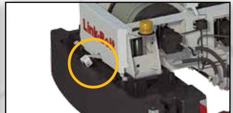
Rear viewing camera