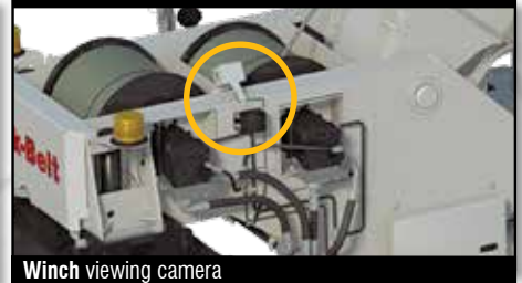
Winch viewing camera